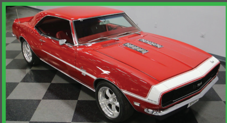
446 1968 CHEVROLET CAMARO RS/SS COUPE 396 V-8 Engine • Muncie 4-Speed Manual Trans. • Red Deluxe Interior with Bucket Seats and Center Console • Vintage A/C • P/Steering