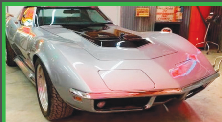
462 1969 CHEVROLET CORVETTE 427 COUPE

4.6L 32-Valve DOHC V-8 Engine • Tremec 5-Speed Manual Trans. • Black Leather Interior • Cruise Control • P/Steering, Seats, Windows & Locks