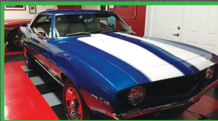
525 1969 CHEVROLET CAMARO Z28 COUPE 302 V-8 Engine with 290 HP • Muncie 4-Speed Manual Trans. • White Interior • All Original • Hurst Shifter • Original Rally Wheels and Caps