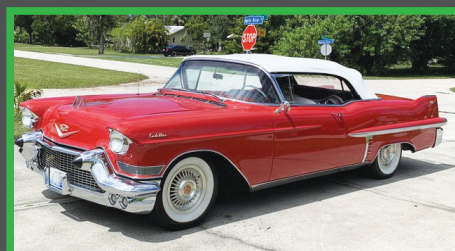
444 1957 CADILLAC SERIES 62 CONVERTIBLE 365 V-8 Engine • Automatic Trans. • White Interior • White Conv. Soft Top • All Power Options • Wide White Wall Tires • Excellent Prof. Restoration