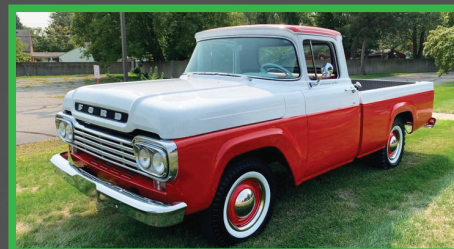
196 1959 FORD F100 PICKUP

Original 4 Cylinder • 3-Speed Manual Trans. • Tan, Green & White Interior • Show Quality Paint • AM Radio • Runs Excellent