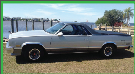
137 1987 CHEVROLET EL CAMINO PICKUP 305 V-8 Engine • Automatic Trans. • Gray Cloth Interior • 60/40 Special Option Seats • P/Steering • P/Brakes • A/C • AM/FM Audio • Cruise Control