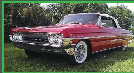
442 1961 OLDSMOBILE SUPER 88 CONVERTIBLE 394 V-8 Engine • Automatic Trans. • Tri-Color Interior • Power White Convertible Soft Top • P/Steering • P/Brakes • Fender Skirts • Wire Hubcaps