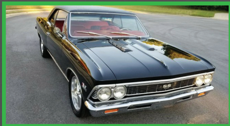
457 1966 CHEVROLET CHEVELLE SS COUPE 396 V-8 375 HP • M22 Muncie Rockcrusher 4-Speed Manual Trans. • Red Interior with Black Vinyl Top • High End Every Nut and Bolt Rotisserie Restoration