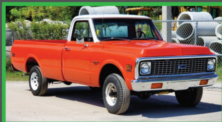
148 1972 CHEVROLET C10 4 X 4 LONG BED PU

292 Cu In V-8 Engine • 4-Speed Manual Trans. • Red & White Interior • Custom Cab • New Bumpers • New Door Handles • New Mirrors