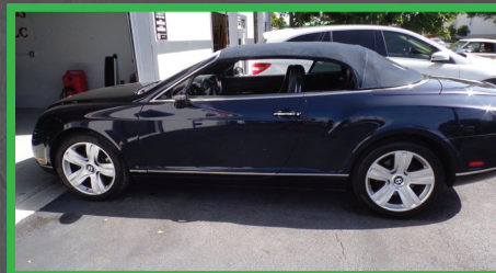
215 2007 BENTLEY GTC CONVERTIBLE 6.0 Liter W-12 Engine 552 HP • Automatic Trans. • Navy Blue Exterior over Black Interior • A/C • P/Windows • P/Locks • P/Steering • Tilt Wheel