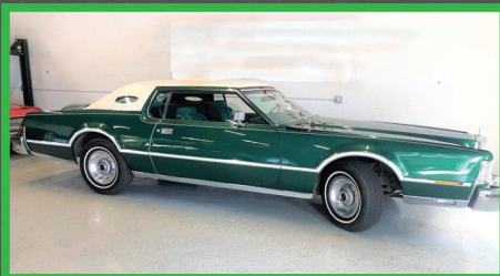
553 1976 LINCOLN MARK IV COUPE 460 V-8 Engine • Auto. Trans. • Green Plush Interior • Beige Vinyl Top • P/Steering • P/Brakes • A/C • Tinted Glass • Hideaway Headlights • 28,410 Miles