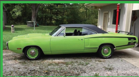
441 1970 DODGE CORONET SUPER BEE TRIBUTE 383 Stroker V-8 Engine • 4-Speed Manual Trans. • New Interior & Brakes • New Fuel Lines • Real Grabber Hood • Spoiler Wing • Gears 4.10 / 8-3/4