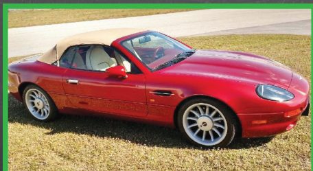
538 1997 ASTON MARTIN DB7 VOLANTE CONV. 3.2 Liter Straight 6 Cyl. Engine - Supercharged with 335 HP • 4-Speed Automatic Trans. • Rare Special Order Color Combination • P/Windows • P/Brakes