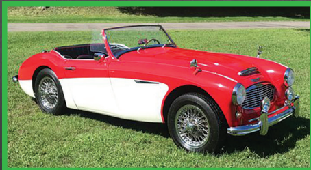
523 1960 AUSTIN HEALEY 3000 CONVERTIBLE 2912cc Inline 6 Cyl. Engine • 4-Speed Manual Trans. • Wire Wheels • Side Curtains • Wood Rimmed Banjo Style Steering Wheel • Restoration Binder