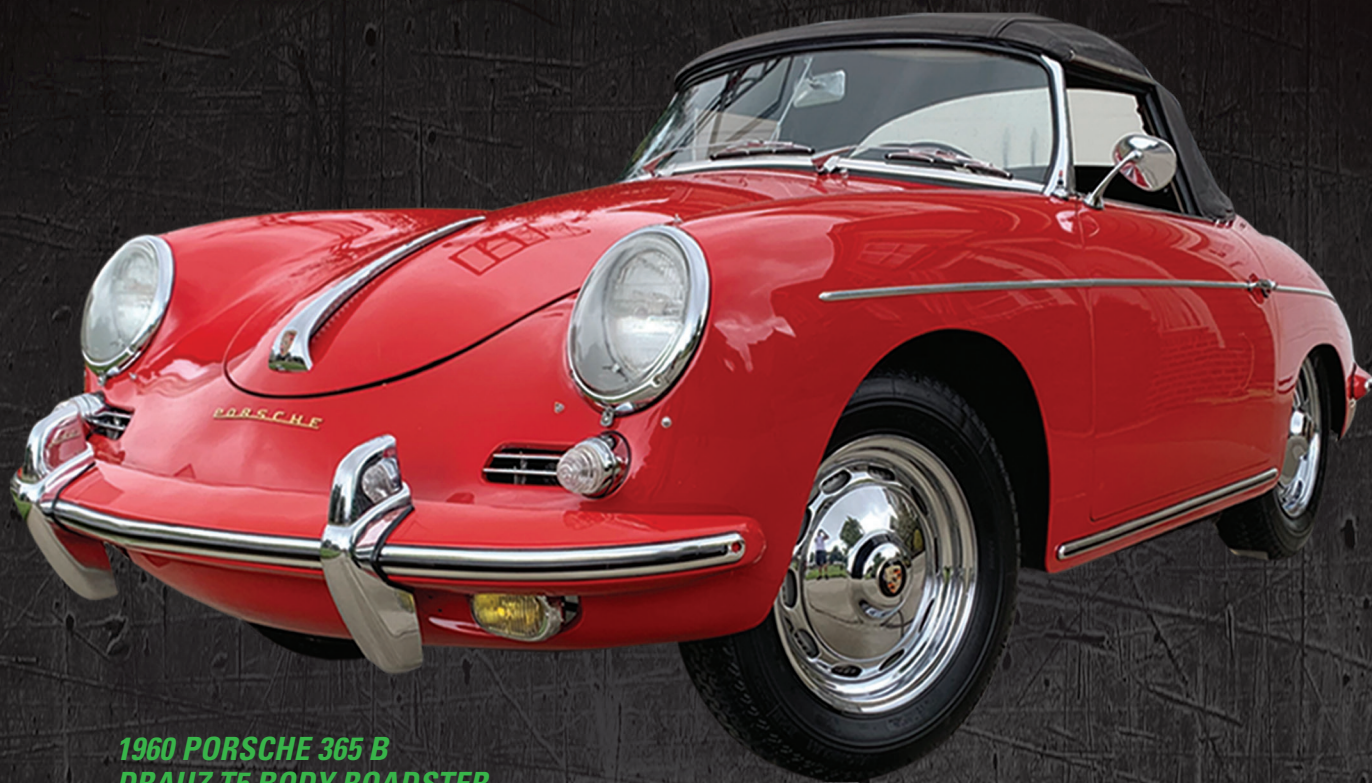
1960 PORSCHE 365 B DRAUZ T5 BODY ROADSTER