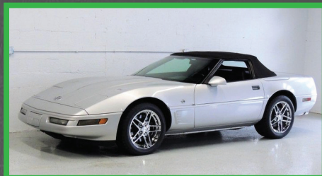
178 1996 CHEVROLET CORVETTE COLLECTOR'S EDITION CONVERTIBLE LT1 5.7 Liter 350 V-8 Engine with 300 HP • Automatic Transmission • Only 1 of 1,381 in this Color Combo