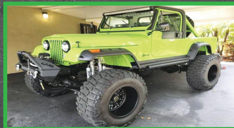
250 1981 JEEP CJ8 SCRAMBLER CUSTOM 4 X 4 Corvette LS2 V-8 Engine • 4-Speed Manual Trans. • Black Interior • Black Mountain Bucket Seats • New Custom Finished Interior • Ice Cold A/C • Tilt Steering Column • 4 Wheel Disc Brakes