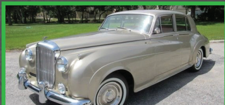
490 1960 BENTLEY S2 SALOON V-8 Aluminum Block Engine • Automatic Trans. • Light Beige Interior Piped in Burgundy • LHD US Delivered • From Bentley Enthusiast for Past 27 Years