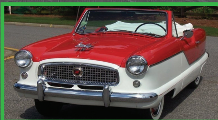
151 1961 NASH METROPOLITAN CONVERTIBLE

6.2 Liter V-8 Engine • Auto. Trans. • Only 32,465 Actual Miles • Four Wheel Drive • Leather and Wood Interior