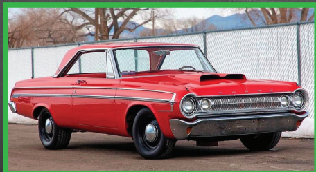
183 1964 DODGE POLARA HARDTOP 426 Max Wedge V-8 with Cross Ram Intake and Dual 4-Barrel Carbs • 4-Speed Manual Correct Linkage • Rare A-833 Transmission with only 65 made