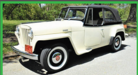
234 1949 WILLYS OVERLAND JEEPSTER 134 Willys L "Go Devil" Straight 4 Cyl. Engine • 3-Speed Manual Trans. on the Column with Borg Warner OD • Numbers Matching • Side Curtains