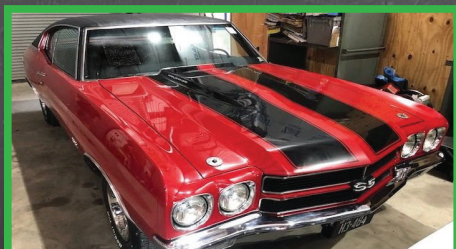
483 1970 CHEVROLET CHEVELLE SS LS6 COUPE True Matching Numbers 454 V-8 with 450 HP • M-21 Muncie 4-Speed Manual • Only 1 of 4,000 Made • P/Steering & Brakes • Tilt • MacNeish Certified