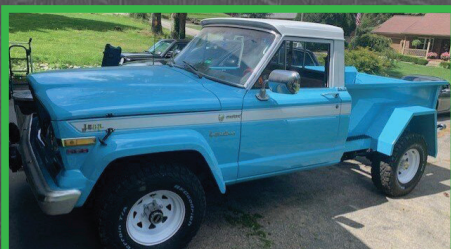
405 1979 JEEP GLADIATOR CUSTOM 4X4 PU 360 CI V-8 Engine • Manual Trans. • Alligator Interior • Complete Frame Off Restoration • Painted and Detailed Chassis • Custom Aftermarket Steel Wheels