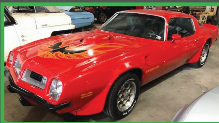
445 1975 PONTIAC TRANS AM COUPE 6.6 Liter V-8 Engine • Rare 4-Speed Manual Trans. • Black Interior • Bucket Seats • Center Console • Honeycomb Wheels • BF Goodrich Radial T/A Tires