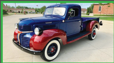
419 1946 DODGE W20 3/4 TON PICKUP 218 Cu In Flathead 6 Cyl. Engine • 3-Speed Manual Trans. • Black Interior • Brand New Wood Box • All New Glass w/Crank Out Front Windshield