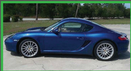
171 2008 PORSCHE CAYMAN COUPE 2.7 Liter 6 Cylinder Engine • Tiptronic Automatic Trans. • Beige Interior • Dual Power Leather Seats • Mid Engine Rear Wheel Drive • A/C • P/Steering