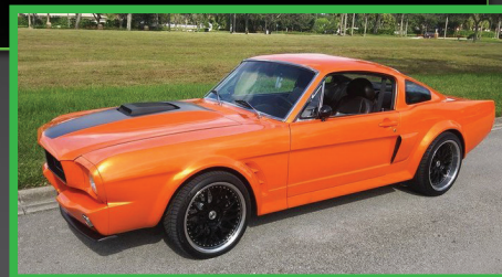
517 1966 FORD MUSTANG FASTBACK RESTOMOD

308 CI 6 Cylinder Race Engine • 4-Speed Automatic Trans. • Tan Soft Top • AM Radio with Power Antenna