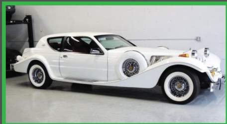
227 1988 MERCURY TIFFANY COUPE 5.0 Liter Fuel-Injected V-8 Engine • Automatic Trans. with OD • Red Leather Interior • A/C • P/Brakes, Steering, Windows and Locks • Tilt Steering