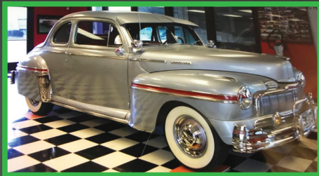
187 1948 MERCURY DELUXE COUPE Original Flathead V-8 Engine • Dual Spotlights • Fender Skirts • Fog Lights • Radio • Heater • Clock • Chrome Bumper Extensions