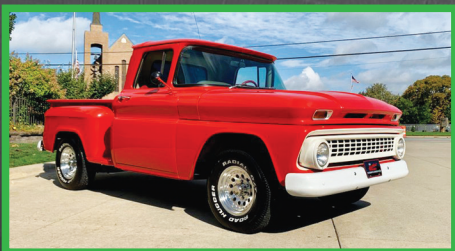
220 1963 CHEVROLET C10 STEPSIDE PICKUP Original 6 Cyl. Engine • 3-Speed Manual Trans. • Red & White Interior • Ground Up Restoration • Headers • Dual Carbs and Exhaust • Oak Wood Bed