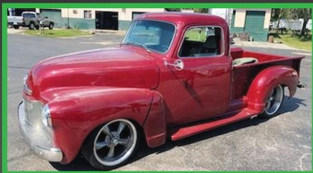
140 1950 CHEVROLET 3100 CUSTOM PICKUP 350 CI V-8 Engine Producing Nearly 500 HP • Automatic Trans. • Two-Tone Gray Leather Interior • Professional Build • P/Steering • P/Locks • A/C