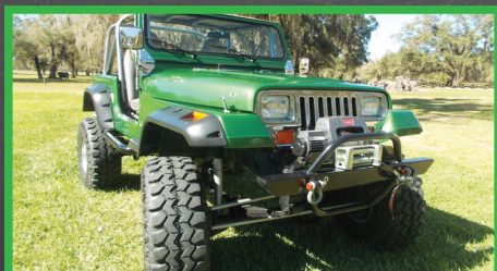
167 1989 JEEP WRANGLER 4X4 SPORT UTILITY Crate 350 V-8 Engine • Jet 700R-4 Automatic Trans. • Frame Up Restoration with All New Parts • AGR P/Steering System • Four Wheel Disc Brakes