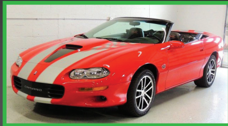
154 2002 CHEVROLET CAMARO SS 35TH ANNIVERSARY CONVERTIBLE 5.7 Liter LS1 Engine 325 HP • Automatic Trans. • SLP Package • A/C • P/Steering • P/Brakes • Tilt