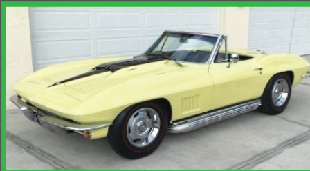
504 1967 CHEVROLET CORVETTE 427 CONV. 427 V-8 Engine with 390 HP • 4-Speed Manual Trans. • Black Convertible Soft Top • Black Stinger Hood • Both Tops • Side Exhausts • Frame Off Restoration