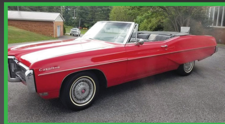
218 1968 PONTIAC CATALINA CONVERTIBLE 400 CI V-8 Engine • Auto. Trans. • Red Exterior over Black Interior • Black Convertible Top • Tonneau Cover • Clean Interior • P/Brakes • P/Steering