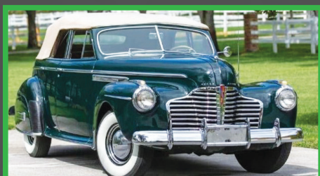
506 1941 BUICK ROADMASTER CVT PHAETON 320 Fireball Dynafash Inline 8 Cyl. 165 HP • 3-Speed Manual Trans. • Verde Green over Tan Cloth Interior • Only 1 Known to Exist with Cloth Interior