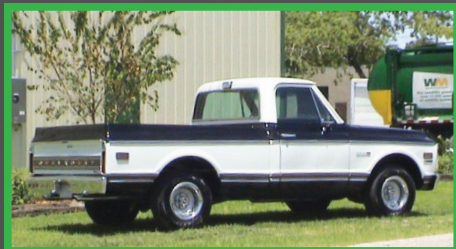
134 1972 CHEVROLET CHEYENNE 10 SHORT BED PICKUP New 454 Big Block V8 Engine • New 400 Turbo Automatic Trans. • Black Interior • P/S • P/B