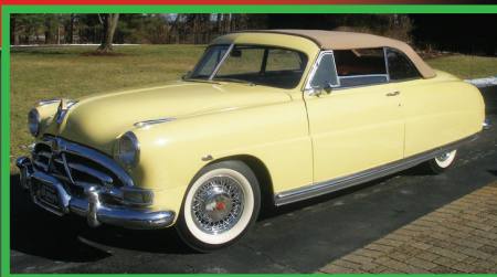
224 1951 HUDSON HORNET CUSTOM TRIBUTE CONVERTIBLE

6.1L Hemi V-8 w/425 hp, 420 lb feet of torque • 5-Speed Auto. w/Manumatic Shifting • Hemi Orange Pearl w/White Stripes • Bucket Seats