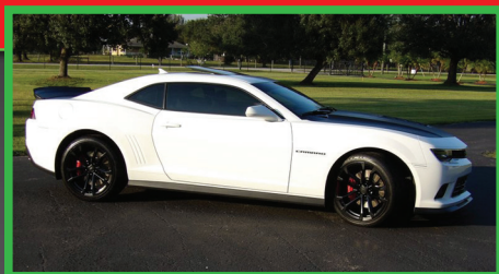
190 2015 CHEVROLET CAMARO 2SS 1LE COUPE 6.2 Liter V-8 Engine with SFI and 426 HP • 6-Speed Manual Trans. • Black Interior • Rare - 1 of 2,737 Built and only 741 in Summit White • 1LE Package