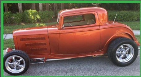
479 1932 FORD 3-WINDOW STREET ROD COUPE 350/290HP V-8 w/Edelbrock 4 BBL • TH350 Automatic Trans. w/Fans • Bucket Seats w/Vinyl Interior • Design Headliner • Lokar Shifter & E-Brake • A/C