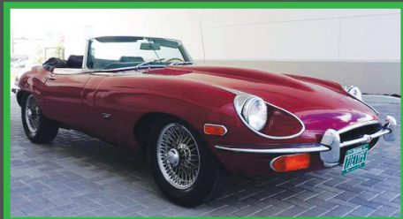
465 1971 JAGUAR XKE ROADSTER 4.2 Liter Inline 6 Cylinder • 4-Speed Manual Trans. • Black Interior • Wire Wheels • Many Service Records • Mostly Original Paint, All Original Interior