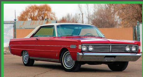
143 1966 MERCURY S-55 HARDTOP 428 V-8 Engine • Cruise-O-Matic Automatic Trans. • White Interior • White Vinyl Top • Bucket Seats and Center Console • P/Steering • P/Brakes • A/C