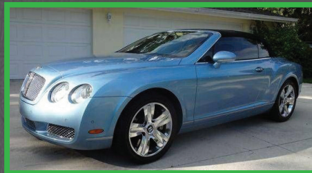
496 2007 BENTLEY CONTINENTAL GTC CONV. 6.0 Liter W-12 Engine Twin Turbo 612 HP • 6-Speed Auto. Trans. • Lakeside Silver Blue Metallic over Ochre Luxury Cream Interior • Premium Leather