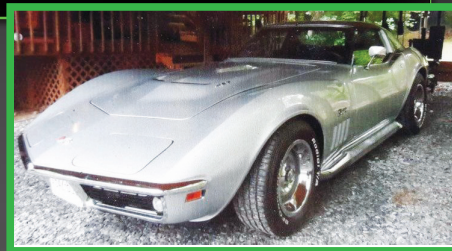
423 1969 CHEVROLET CORVETTE 427 COUPE 427 V-8 Engine with 390 HP Numbers Matching • 4-Speed Manual Trans. • Cortez Silver over Black Interior • P/Steering • P/Brakes • Side Exhaust