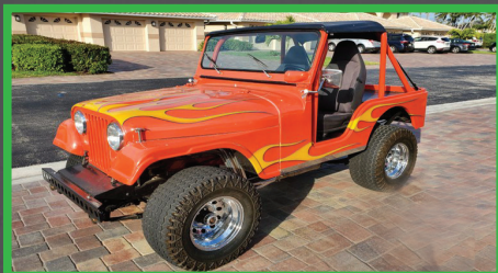
147 1974 JEEP CJ 5 4 X 4 SPORT UTILITY Recent Rebuild on the 350 V-8 Engine • 4-Speed Auto. Trans. • Charcoal Interior • Fiberglass Body 350 V-8 Rebuilt by Maurice of Lakeland