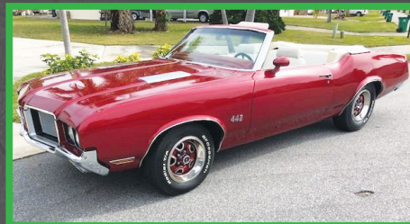
205 1972 OLDSMOBILE CUTLASS 442 TRIBUTE CONVERTIBLE 350 V-8 • Automatic Trans. • White Conv. Soft Top & Boot • Rallye Wheels • BF Goodrich Radial T/A Tires