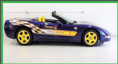
244 1998 CHEVROLET CORVETTE INDY PACE CAR CONVERTIBLE 5.7 Liter LS1 V-8 Engine with 345 HP • Auto. Trans. • Only 1 of 1,163 Pace Cars Produced • 47,000 miles