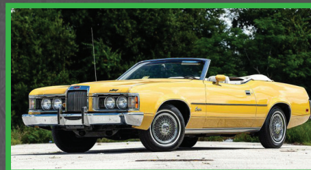
232 1973 MERCURY COUGAR XR-7 CONV.

239 V-8 Engine • 3-Speed Manual Trans. with OD • Brown Leather • Period Correct Dated Logos Award Winner • From a Once in a Lifetime Collection