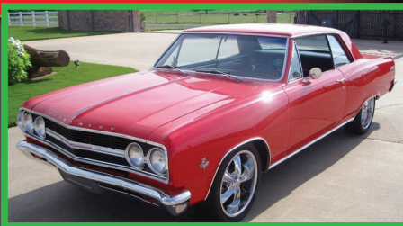
421 1965 CHEVROLET CHEVELLE MALIBU SS RESTOMOD New 396 Big Block V-8 Engine • Turbo 350 Auto. Trans. • Black Vinyl Bucket Seats • Aluminum Heads