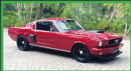
422 1966 FORD MUSTANG FASTBACK 402 IR Roush F.I. Crate Engine • 500 HP / 500 Ft of Torque • 5-Speed Manual Trans. • Red and White Interior • Tilt Steering Wheel • Power Steering