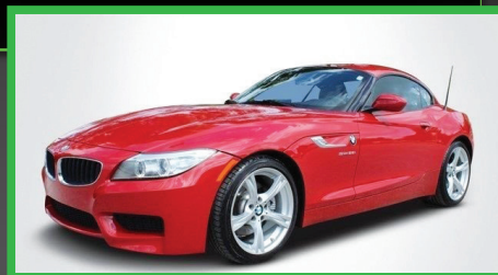
241 2015 BMW Z4 ROADSTER S Drive 28i 4 Cylinder Engine • Automatic Trans. with Paddle Shift • Black Leatherette Interior • P/Steering, Brakes, Soft top and Seats • Only 24,000 Actual Miles