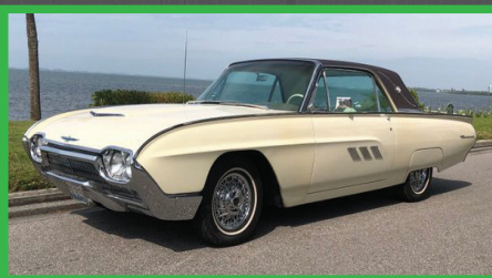
492 1963 FORD THUNDERBIRD PRINCIPALITY OF MONACO SPECIAL EDITION LANDAU 390 V-8 Engine • Auto. Trans. • Ivory Interior • Brown Vinyl Top • A/C • P/Steering, Brakes and Windows