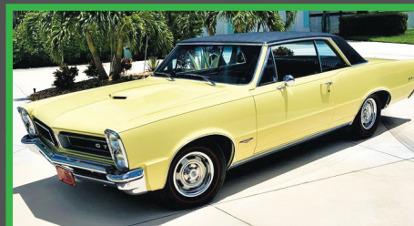
237 1965 PONTIAC GTO COUPE 389 Tri-Power V-8, Born with a 4bbl • 2-Speed Automatic Trans. • Black Interior and Vinyl Top • Factory A/C • Console with Bucket Seats