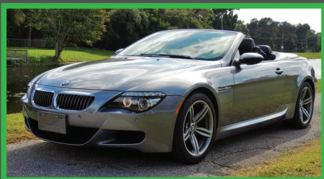
221 2008 BMW M6 CONVERTIBLE 5.0 Liter 10 Cylinder Engine • 7-Speed Auto. Trans. • Black Interior • A/C • P/Windows, Locks, Steering • Tilt Wheel • AM/ FM/ CD/ MP3 Satellite