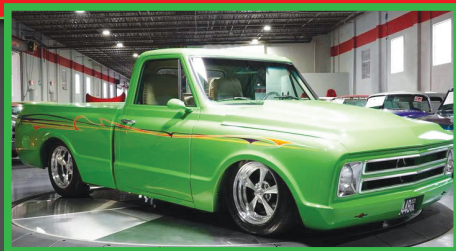
229 1967 CHEVY C10 CUSTOM SHORTBED PU 350 V-8 Engine • Automatic Trans. • Tan Interior • A/C • P/Brakes • Digital Dash • Tubbed Rearend • Custom Show Wheels, Graphics, Turn Signals