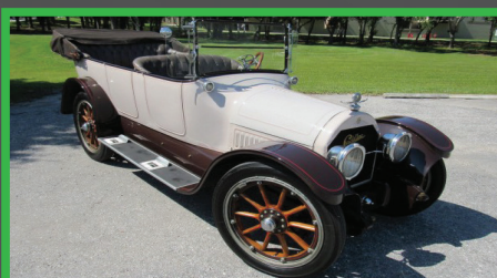
485 1916 CADILLAC TYPE 53 7 PASS. TOURING 314 CI V-8 Engine • 3 Speed Manual with OD • Side Curtains • 27" Artillery Wheels with Spares • 2 Horns Matching Numbers • Runs Well • Ready to Tour