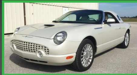
225 2005 FORD THUNDERBIRD 50TH ANNIVERSARY CONVERTIBLE - CASHMERE LTD EDITION 3.9L V-8 Engine • Auto. Trans. • Cashmere Leather • Both Tops • Only 17,000 Actual Miles • P/Steering