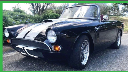
458 1965 SUNBEAM TIGER ROADSTER Slightly Cammed 289 CI V-8 Engine w/Holly 4 BBL • 5-Speed Manual Trans. • Ferrari Inspired Maroon Seats • Functional Air Scooped Hood • Dana Rearend