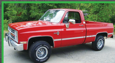
238 1985 CHEVROLET K-10 SILVERADO 4X4 PU V-8 350 Powered • Automatic Trans. • Black Interior • P/Steering • P/Windows • P/Brakes • A/C • Intermittent Wipers • Dual Side Saddle Fuel Tanks