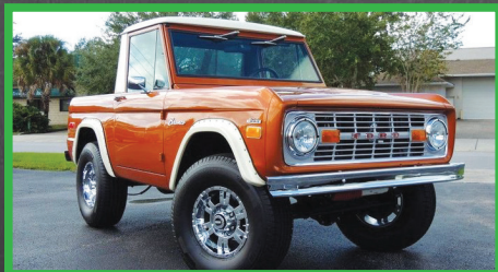
440 1976 FORD BRONCO 302 V-8 Engine • L4 Automatic Trans. • Black Interior • Edelbrock Performer Intake • JBA Ceramic Headers • MSD Ignition • Vintage A/C • Ion Wheels