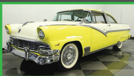
507 1956 FORD CROWN VICTORIA HARDTOP 292 T-bird V-8 Engine • Automatic Trans. • Black and White Interior • P/Steering • 95% Original • All Original Interior • Continental Kit • Fender Skirts