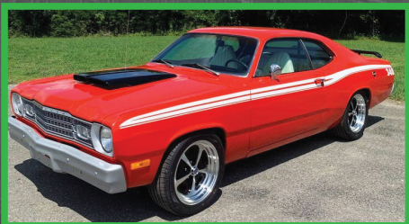
200 1973 PLYMOUTH DUSTER COUPE Rebuilt 340 V-8 Engine H Code • 4-Speed Manual Trans. with Pistol Grip Shifter • White Bucket Seats • True 340 H Code Duster • P/Steering • Disc Brakes