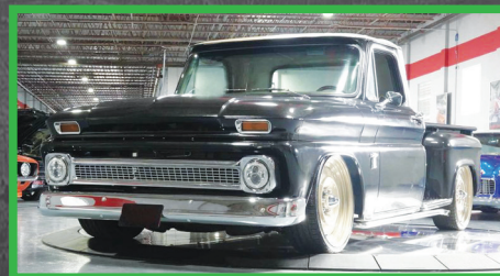
236 1964 CHEVROLET C10 CUSTOM PICKUP 350 V-8 Engine • Automatic Trans. • Black and White Interior • White Roof Exterior • Nice Wood Bed • Steel Disc Wheels • Low Custom Profile