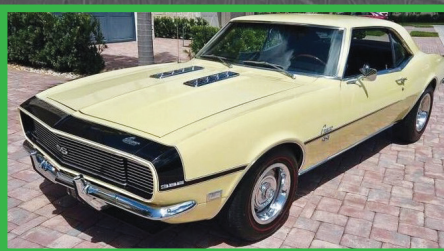
509 1968 CHEVROLET CAMARO SS 396 COUPE 396/375 HP Engine • Muncie 4-Speed Trans. • Correct Black Deluxe Interior • 12 Bolt Rear End • Frame Off Restoration • Loaded with Options