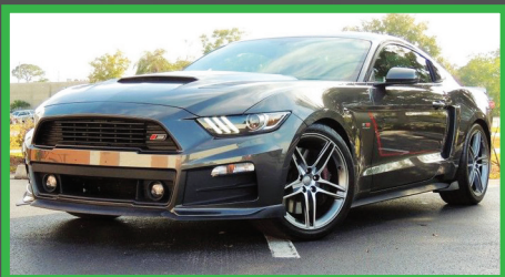
521 2016 FORD ROUSH STAGE 3 MUSTANG CPE 5.0L V-8 Roushcharged 670 HP Engine • 6-Speed Manual Trans. • Black Leather 6-Way Power Seats (Heated and Cooled) • Factory Voice-Act Navigation