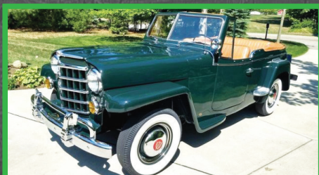
199 1950 WILLEYS JEEPSTER CONVERTIBLE 4 Cylinder Engine • Automatic OD Trans. Completely Rebuilt • New Tan Interior • White Conv. Soft Top • Engine Rebuilt about 7,000 Miles Ago • Show Quality Jeepster • Runs and Drives Great