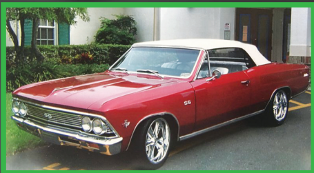
503 1966 CHEVROLET CHEVELLE MALIBU CONV. Fitech F.I. 327 CI V-8 Engine • Automatic Trans. • White Buckets • White Soft Top • Center Console • P/Steering • Power Disc Brakes • Vintage A/C