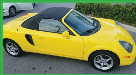
131 2001 TOYOTA MR2 SPYDER 1.8 Liter 4 Cyl. Engine • 5-Speed Manual Trans. • Two Owner Car • Very Clean • Hard to Find Color • Runs and Drives Like New • 45,521 Actual Miles