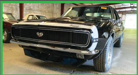
231 1967 CHEVROLET CAMARO RS/SS COUPE 427 V-8 Hi-Performance Big Block Engine • 4-Speed Manual Trans. • Rare Triple Black Combination • P/Steering • P/Disc Brakes • Polished Alum. Heads