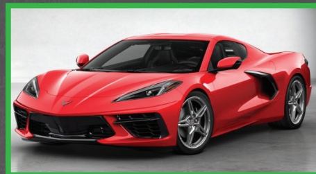
488 2020 CHEVROLET CORVETTE C8 2LT COUPE 6.2 Liter V-8 Engine with 490 HP 8-Speed • Automatic Dual Clutch with OD • Z51 Option Pkg. • Performance Exhaust and Brakes • Only 13 Miles!