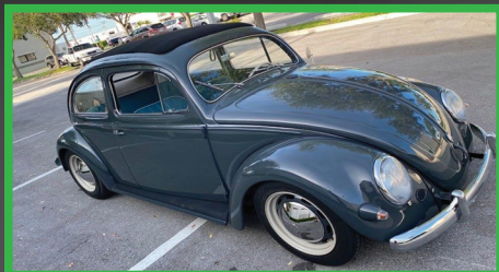
172 1957 VOLKSWAGEN BEETLE CALIFORNIA SLIDE BACK ROOF COUPE 1192 cc 4 Cylinder Engine • 3-Speed Manual Trans. • Blue Interior • Like New • Showroom Condition