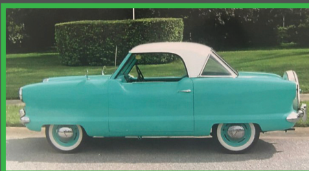
169 1954 NASH METROPOLITAN COUPE

Rebuilt Matching Numbers 427/390 HP Engine • Rebuilt Muncie M20 4-Speed Trans. • Black Leather • Custom Paint • Vintage Air • P/Windows • T-Tops