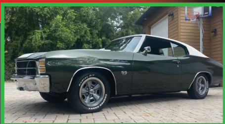
493 1971 CHEVROLET CHEVELLE SS COUPE 454 V-8 Engine - Non Original Motor • Original M-22 Rockcrusher 4-Speed Manual Trans. • Ochra Interior • Tan Vinyl Top • Original 12-Bolt Posi-Rear End