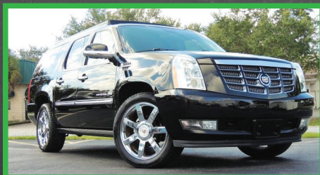
210 2013 CADILLAC ESCALADE ESV CEO EXECUTIVE LIMOUSINE CONVERSION

351 V-8 Engine • Auto. Trans. • White Leather • One Family Owned • 35,000 Actual Miles • AACA Senior Award Winner • P/S • P/B • P/W • Air