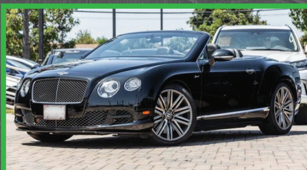
518 2015 BENTLEY CONTINENTAL GTC SPEED CONVERTIBLE 6.0 Liter Turbo W-12 Engine • Auto. Trans. • Black Interior • Mulliner Edition • A/C • P/S • P/W • P/Locks