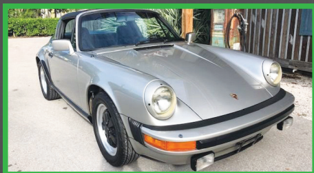
451 1982 PORSCHE 911 CARRERA TARGA COUPE 6 Cylinder • 5-Speed Manual Trans. • Black Leather Interior • Air Conditioning • P/Seat • P/Windows Tool Kit and Spare • Owners Manual • 29,000 Miles