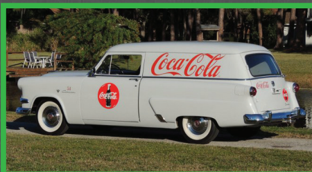
161 1954 FORD COURIER SEDAN DELIVERY

350 V-8 Engine • 4-Speed Manual Trans. • Black Interior • Original Paint • P/Steering • P/Brakes • Body-off Restored