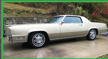
133 1967 CADILLAC ELDORADO HARDTOP 472 V-8 Engine • Automatic Trans. • Rare Factory Light Ivory Leather Bucket Seats • 31,000 Actual Miles • P/Steering • P/Brakes • P/Windows • A/C