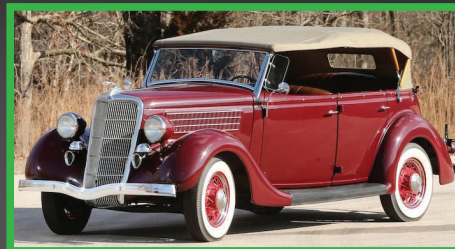
484 1935 FORD MODEL 68 PHAETON Flathead V-8 Engine • 3-Speed Manual Trans. • Tan Interior & Top • Restored to Original Specifications • Wide White Wall Tires