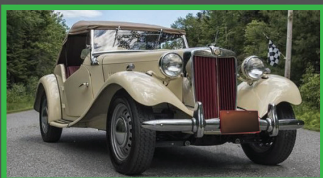
156 1952 MG TD ROADSTER 4 Cyl. Engine with 55 HP • 4-Speed Manual Trans. • Red Interior • Tan Soft Top • One Family Owned Vehicle • High Quality Older Restoration