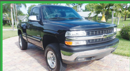
129 2002 CHEVROLET 1500 SILVERADO STEPSIDE SHORTBED 4X4 PICKUP Liter Vortec V-8 Engine • Auto. Trans. with Overdrive • Gray Cloth Interior • A/C Blows Cold • P/S • P/B