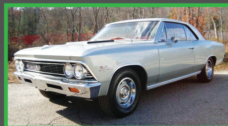
226 1966 CHEVROLET CHEVELLE SS 396 COUPE Real 138-SS Car with Correct "ED" Coded and VIN-Stamped 396/325 V-8 Engine • M-20 4-Speed Manual Trans. • Red Interior • P/Steering • Red Bucket Seats