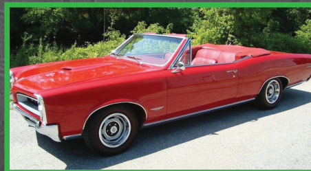
487 1966 PONTIAC GTO CONVERTIBLE Numbers Matching 389 V-8 Engine with 335 HP • 4-Speed Manual Trans. Wide Ratio "WT Code" • Red Vinyl Buckets • P/White Convertible Soft Top • P/Steering • Upgraded Ride / Handling Package