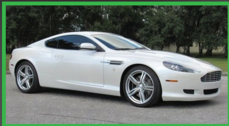
494 2009 ASTON MARTIN DB9 COUPE 6.0L V-12 Engine Delivering 470bhp and 443 lb-ft Touchtronic 2' ZF Automatic Trans. • Kestrel Tan Leather • Only 4,670 Actual Miles • Garage Kept