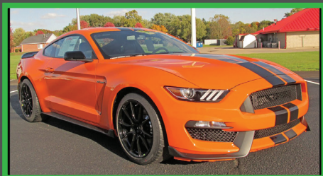
233 2020 FORD MUSTANG GT COUPE V-8 5.0L TI-VTC 460HP • 10 Speed Auto. Trans. • Twister Orange with Hood Stripes • P/Steering, Brakes & Windows • Recaro Leather Trim Seats