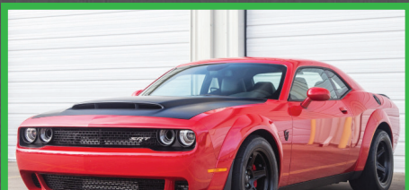
471 2018 DODGE CHALLENGER SRT DEMON 6.2 Liter Supercharged V-8 Hemi Engine • 8-Speed Auto. Trans. • 808 HP / 717 ft/lbs Torque • Comfort Audio Group - Leather Seats • Air Conditioning