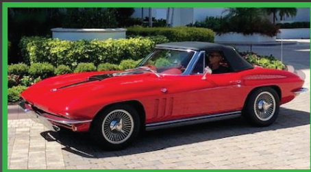
528 1965 CHEVROLET CORVETTE CONVERTIBLE Numbers Matching Correct 327 V-8 Engine with 300 HP • Automatic Trans. • Correct Red on Red from the Factory • Correct Leather Interior