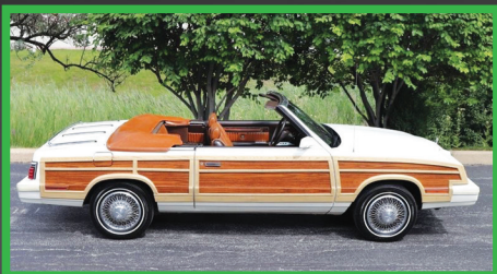
253 1984 CHRYSLER LEBARON CONVERTIBLE - MARK CROSS EDITION 2.6 Liter 4 Cyl. Engine • Automatic Trans. • Brown Leather Interior • White Top • P/S • P/B • P/W • A/C