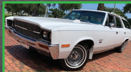
163 1970 AMC AMBASSADOR WAGON

1.5 Liter 4 Cylinder Engine • 3-Speed Manual Trans. • Black and White Interior • White Soft Top • 1 of 853 Produced • Originally a CA car