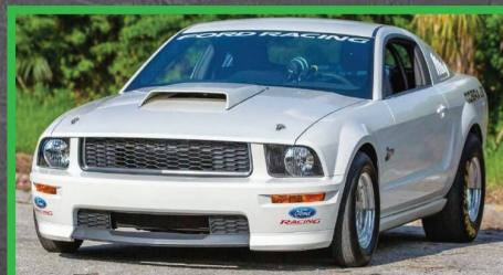
217 2008 FORD MUSTANG COBRA JET COUPE 5.4 Liter Supercharged V-8 Engine • 6-Speed Manual Trans. • Charcoal Interior • Only 1 of 50 Produced - FR500CJ #11 • Only 8 Actual Miles!