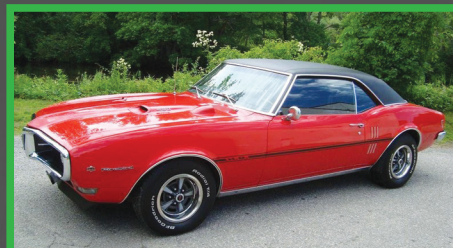
213 1968 PONTIAC FIREBIRD 400 COUPE Rebuilt 400 Big Block V-8 Engine (NOM-1967) • Updated 700R Auto. OD Trans. • Black Factory Deluxe Interior • Original 10-Bolt 3.90 Posi Rear End