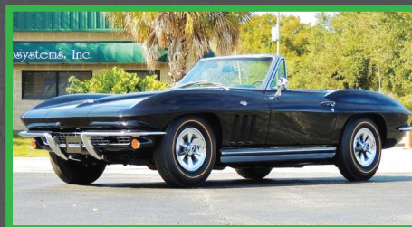
510 1965 CHEVROLET CORVETTE CONVERTIBLE Matching Numbers L76 327/365 HP Engine and 4-Speed Manual Trans. • Black Interior • Black Soft Top • Factory A/C • P/Windows • Goldline Tires