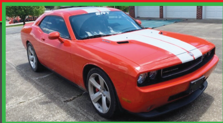
135 2009 DODGE CHALLENGER SRT8 COUPE

6.1L Hemi V-8 w/425 hp, 420 lb feet of torque • 5-Speed Auto. w/Manumatic Shifting • Hemi Orange Pearl w/White Stripes • Bucket Seats