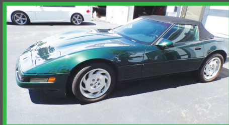
248 1993 CHEVROLET CORVETTE CONVERTIBLE LT1 350 V-8 Engine with 300 HP • Automatic Trans. • Black Leather Interior • Black Soft Top • Electronic Climate Control • FX3 Adjustable Ride Control